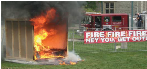
Fire Burn 2010